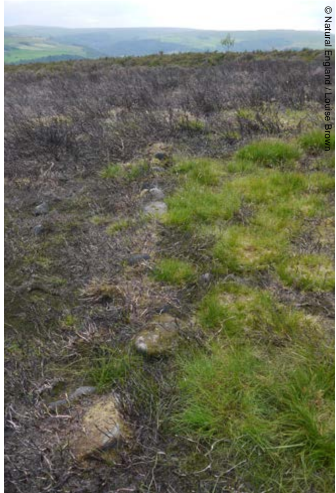
A barely visible prehistoric stone row on moorland in West Yorkshire (centre of photograph, running from bottom left). Features such as this are easily hidden by vegetation. Both the feature and machinery can be accidentally damaged

You will need to work with relevant stakeholders and archaeological contractors to ensure that the design and methodology of any work minimises potential harm and maximises the historic environment benefits. A well-planned restoration project will make a significant contribution to conserving this valuable resource for future generations. In almost all cases, this approach is preferable to the continuation of the uncontrolled and unrecorded loss caused by peat degradation.