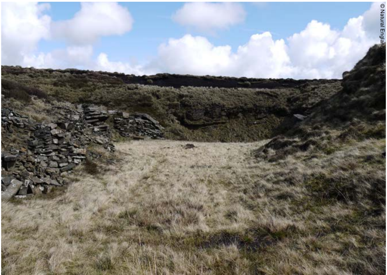
This sandstone quarry at Nab Hill, West Yorkshire sits below an eroding peat section (top of photograph). Quarrying activity may be clearly visible in the landscape, or may take the form of odd-shaped earthworks representing shallow extraction pits and spoil heaps

Much of the archaeology of peatlands is unknown and unrecorded. This is partly due to the less intensive activity carried out in these landscapes, the difficulty in recognising some of the features, the inaccessibility of some of the locations, and a lack of systematic recording.