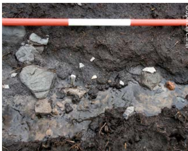
An example of Iron Age timbers discovered at Beccles, Suffolk during flood engineering works in 2006. This demonstrates the excellent survival of organic remains that do not survive on drier sites