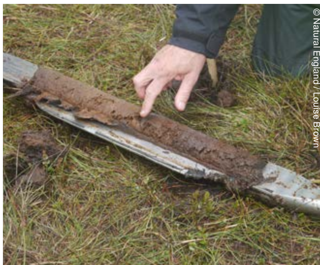
Peat cores are taken to determine the depth of the peat and for palaeoenvironmental analysis, eg pollen and plant remains

These valuable historic environment features depend upon healthy, stable habitats within fully functioning ecosystems for their long-term survival. As peatland habitats degrade these historic features are being lost at an unprecedented rate. In the last half of the 20th century it is estimated that nearly 80% of England's known wetland archaeological resource has been altered or lost (Van de Noort et al. 2002) and this is ongoing. Immediate action is necessary in order to halt these unsustainable losses.