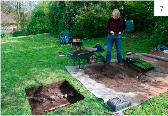
Image 7 Test pitting as part of a community archaeology project at East Harptree, Bath and North East Somerset.