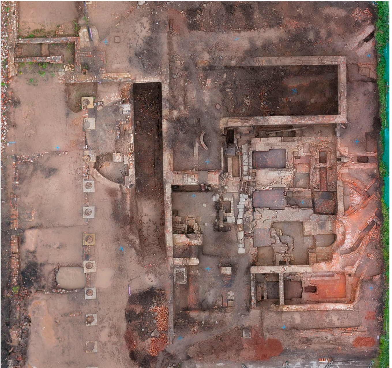
Figure 12: The archaeological excavation of Richard Arkwright's Shudehill Mill in 2014-15, Manchester's first steam-powered textile mill, yielded nationally significant information for the sequence of power plant, including physical evidence for a waterwheel pit and an associated steam-powered water-returning system.

heating, fire-prevention measures and sanitation systems), textile mills that retain all the component elements of their steam-power plant are increasingly rare, although significant evidence can be gleaned from an examination of the fabric and any associated below-ground remains (both within the buildings and outside). On cleared sites, with no upstanding remains, archaeological investigation is often the only means available to elucidate the structural and technological development of a mill complex and can produce hugely significant results.