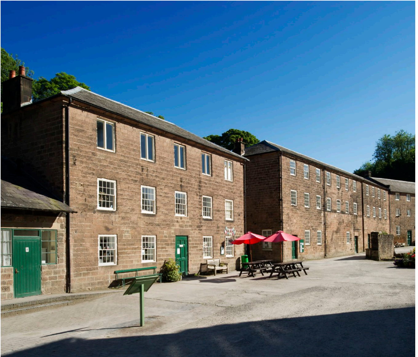
Figure 3: Cromford Mills, Derbyshire, was Richard Arkwright's first mill complex. It is now part of the Derwent Valley Mills World Heritage Site with the mill also Grade I listed.

Initially, Arkwright experimented with his patent machinery in a horse-powered mill in Nottingham and went on to build a water-powered mill at Cromford on the River Derwent in 1771. Widely acknowledged to be the world's first cotton factory, this five-storey mill was imitated across the country by other pioneers of the cotton industry and, by 1784, there were an estimated 143 mills of the same principle in operation.