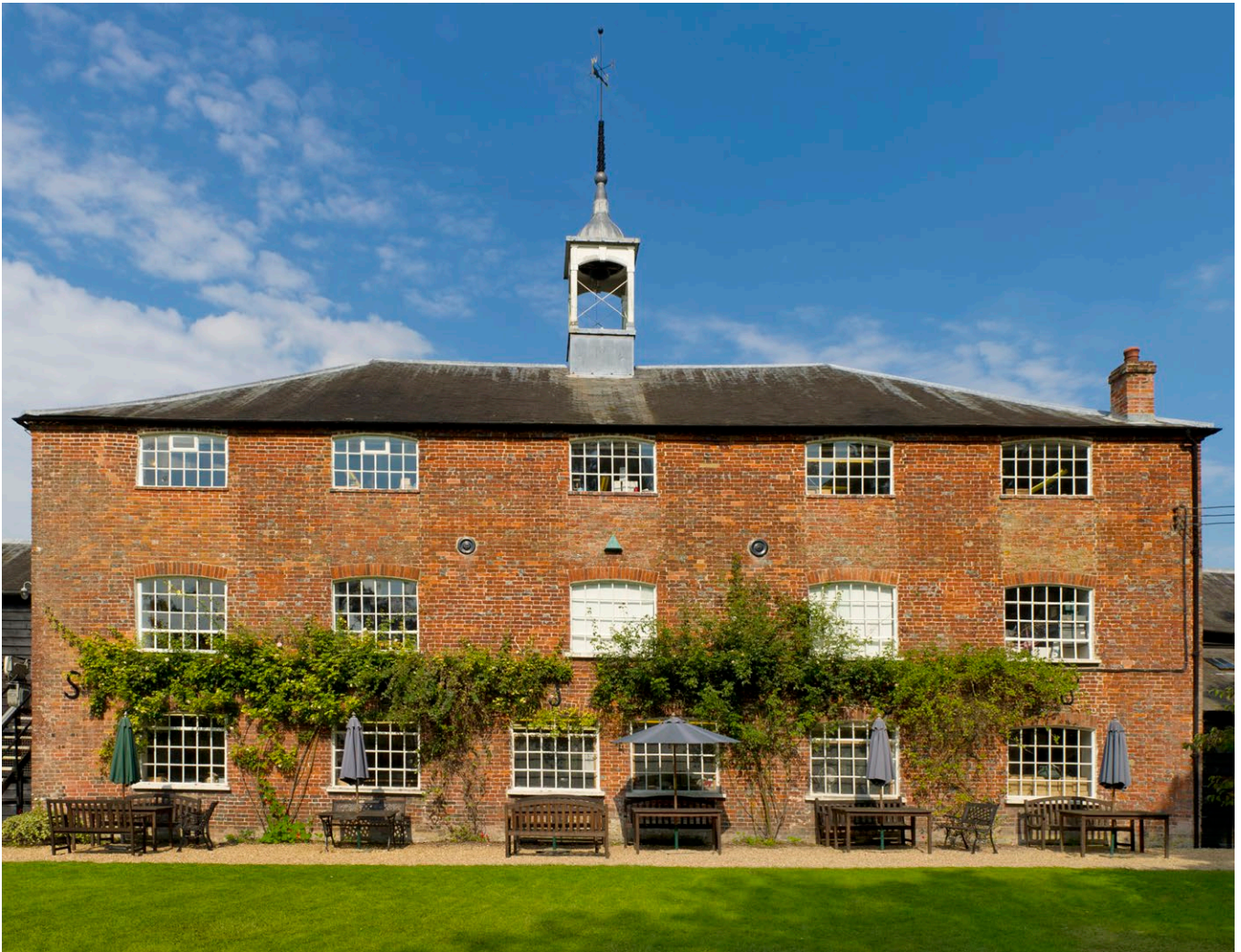
Figure 6: The mill building at Whitchurch Silk Mill (Grade II*) in Hampshire has a classically inspired architectural scheme defined by its decorative pediment. [DP140111]

The additional investment showed pride, confidence and strengthened the competitive edge. Temple Works (1830s/40s), in Leeds, is a particularly exceptional example using an Egyptian revival design modelled on the classical Temple of Edfu. The mill building at Whitchurch Silk Mill in Hampshire, converted from a water-powered sawmill and furniture factory in the early 19th century, is designed in a restrained classically inspired Georgian idiom and provides another interesting example.