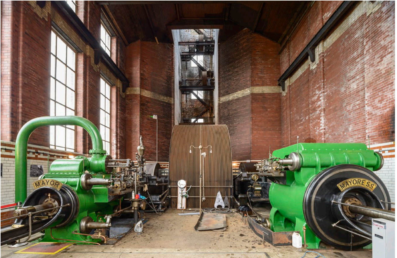
Figure 10: Leigh Spinners Mill (Grade II*) in Leigh, near Wigan, includes a rare example of a twin horizontal cross-compound steam engine, nicknamed Mayor and Mayoress, and one of the largest produced by Lancashire firm Yates and Thom. The engine, situated in its original engine house and including the associated rope drum that transferred power to the machinery, has been successfully restored. [DP217593]

Electricity began to be employed as an alternative source of power in English textile mills during the early Edwardian period, with Acme Mills in Pendleton, Greater Manchester, probably being the first to be driven solely by this means in 1905. Each floor of an electrically powered mill was served by a group-drive motor, and these were frequently housed in a full-height external tower as a precaution against the fire risk that this new technology presented. Other infrastructure required for an electric-drive system often included a transformer house to step the voltage from the mains supply down to that required for the machinery and lighting, whilst some mills produced their own electricity using generators driven by steam turbines.