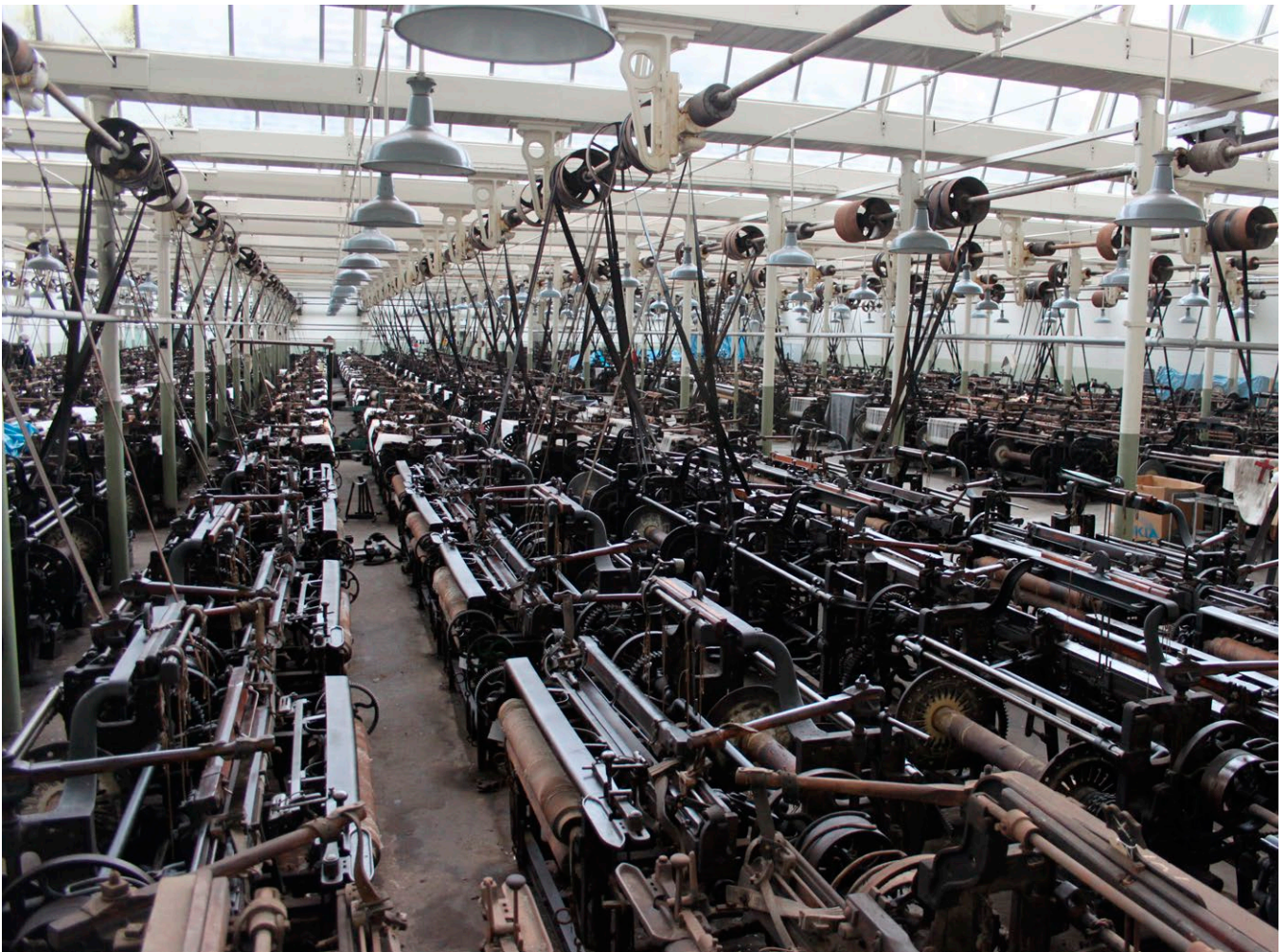
Figure 5: A view across the weaving looms at Queen Street Mill in Harle Syke, Burnley. The exceptional historical interest in the mill, derived not least from the survival of the steam engine that still powers the original working machinery, is reflected in its Grade I listed building status.

However, in the 20th century the industry stood at the edge of the precipice of a terminal decline. A combination of trade depression, coal shortages, the General Strike and financial tightening meant that mills began reducing their output from 1927. A short boom period began in 1945 as a result of shortages caused by the war, but after 1952 British cotton textiles faced intense competition from manufacturers in the Far East. This poor trading situation, coupled with the widespread manufacture of man-made fibres, led to the rapid collapse of the British textile industry.