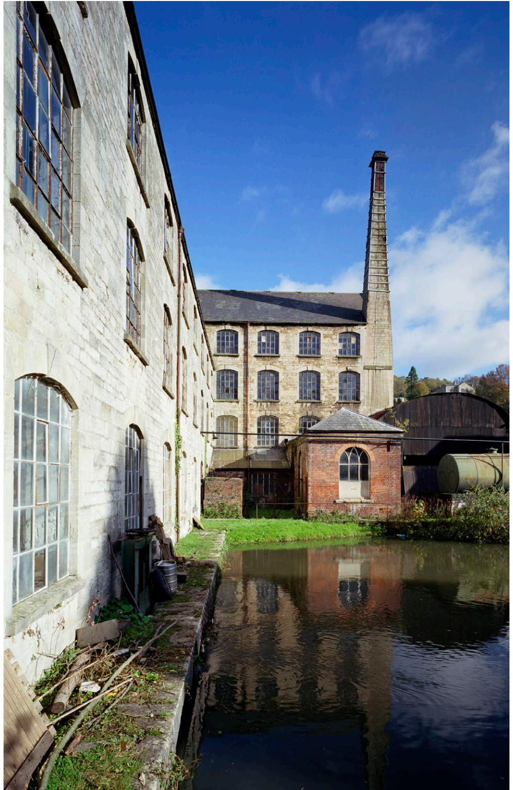
Figure 9: Ham Mill (Grade II), in Thrupp near Stroud, retains an integral, rather than free-standing, chimney complete with an oversailer. [aa017695]

Beam engines began to be superseded by horizontal steam engines in the 1860s, which were frequently placed in large, rectangular engine houses that abutted the multi-storey spinning block. Rope-drive systems were also adopted during the late 19th century, replacing the traditional means of transmitting power from the engine via an upright shaft and bevel gears. These improvements demanded further refinements to textile-mill design, specifically the addition of a rope race to serve each floor of the mill.