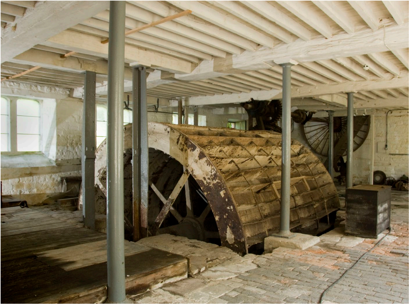
Figure 8: St Mary's Mill (Grade II) in Chalford near Stroud, retains an impressive iron waterwheel, as well as a steam engine. [DP025147]