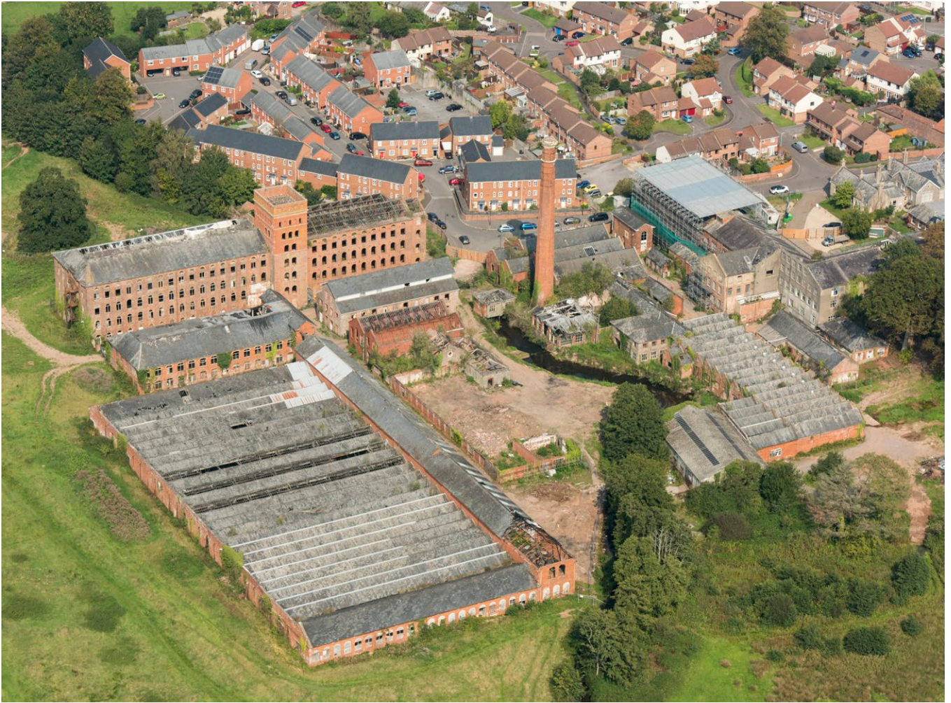
Figure 7: Tonedale Mills in Wellington Somerset (Grade II*), originating in the late 18th century, is one of the largest textile-manufacturing sites in the south-west. It is a key example of an integrated mill complex, incorporating premises for the full range of wool preparation and yarn spinning processes. It retains buildings for spinning, weaving, cleaning and finishing, as well as warehousing, offices, workshops, and multiple phases of buildings for power generation. [33912_029]