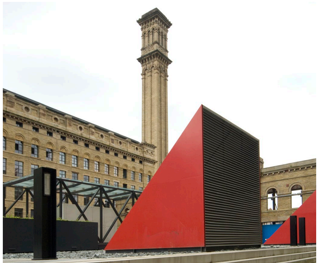
Figure 13: Lister's Mill at Manningham, Bradford built in 1873, is now being converted into residential apartments and ground-floor commercial units. [dp071762]

More information on the transformative potential of textile mill regeneration can be found on Historic England's 'Mills of the North' webpages.