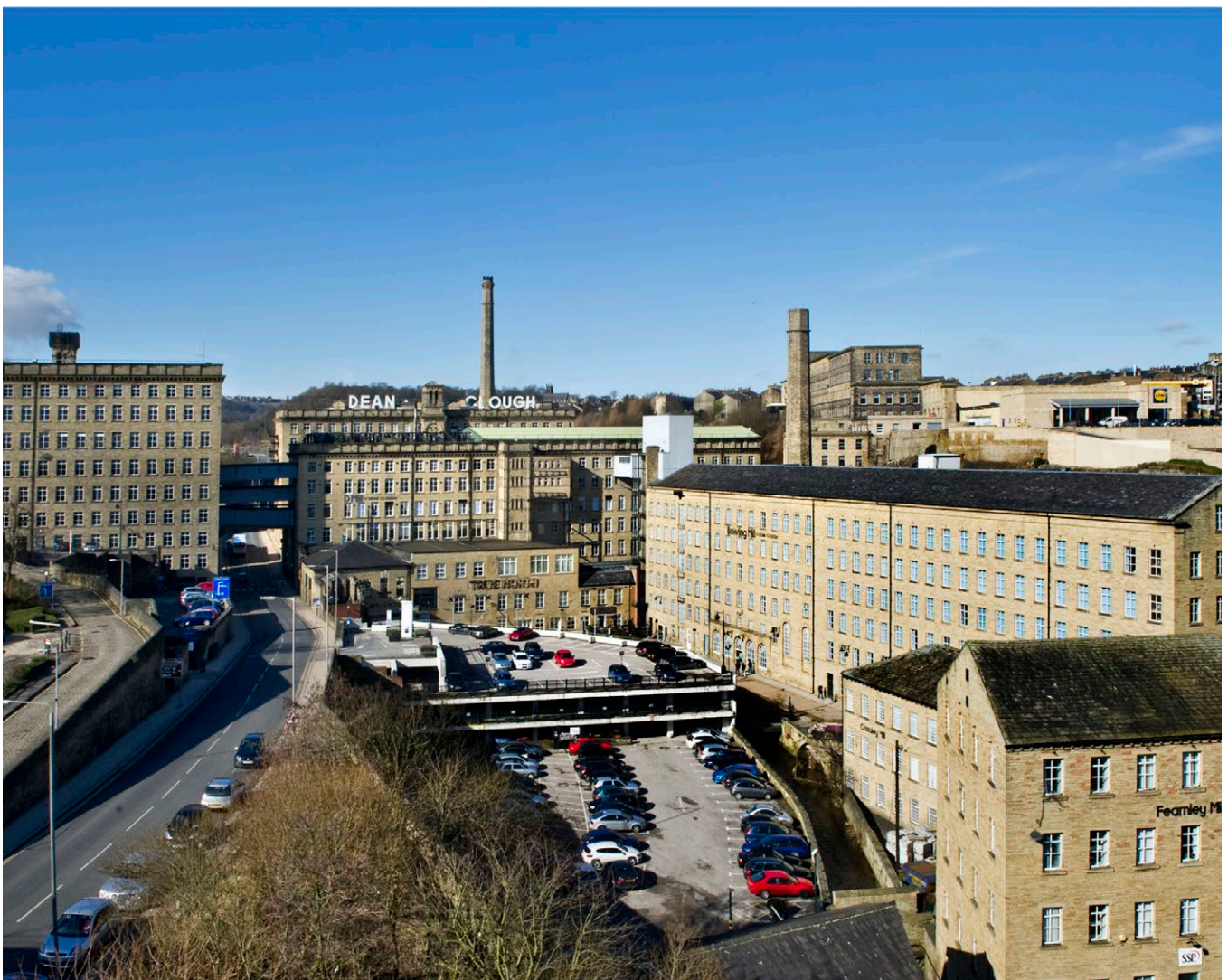
Figure 1: The mid 19th century Dean Clough Mills (Grade II) in Halifax, West Yorkshire, was once the world's largest carpet factory, but has since been transformed into a nationally renowned centre for business, leisure and the arts. [DP087831]

The application of steam power to the industry in the final years of the 18th century led to the birth of the urban textile mill, resulting in the rapid industrial growth of towns across the manufacturing belt of Lancashire, Yorkshire, East Cheshire and North Derbyshire given convenient proximity to the coal fields. The size and complexity of textile mills increased sharply during the second half of the 19th century in response to technological developments in structural engineering and the machinery employed in the mills.