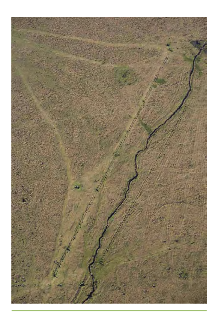
Figure 5 Stone alignment on Longash Common, Dartmoor, Devon.

In England, stone alignments comprising more than two rows are clustered on Exmoor and Dartmoor (Figure 5), with most featuring three lines of stones. As with single and double rows, there is no clear evidence for the heights of stones being graded along the length of the line, although terminal stones may be higher. Spacing between the stones may also be variable.