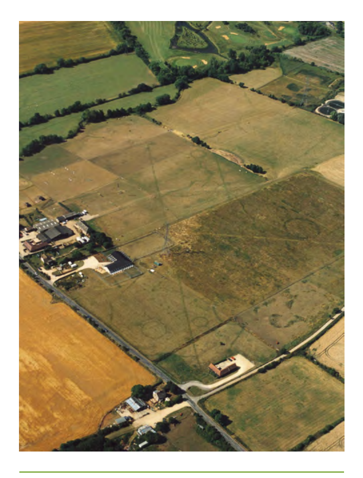
Figure 2 The southern terminal of the cursus known as Drayton South, Oxfordshire. Several ring ditches are also visible.

On sites which have seen the most investigation, it is not unusual to find clear evidence of re-use, for example in the form of recutting the ditch perhaps a millennium or more after the monument was originally constructed. That cursus monuments retained significance in the landscape long after their original use is demonstrated by the frequency with which later monuments, including henges and round barrows, cluster around them (Figure 2). Indeed it is not uncommon to find later monuments being built within cursus monuments – for example, both the Dorset Cursus and the Greater Stonehenge Cursus saw Bronze Age round barrows built inside them.