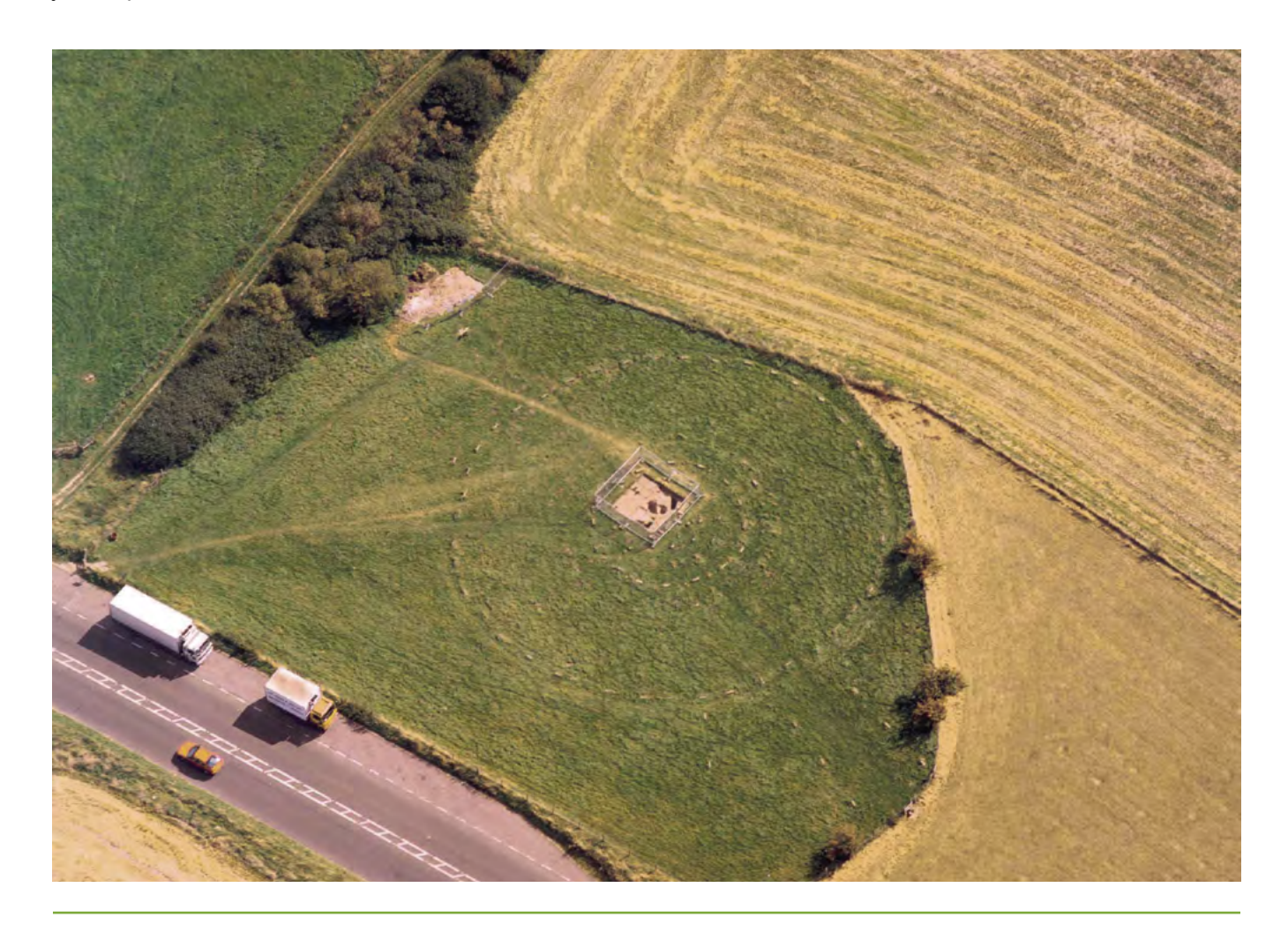
Figure 4 The Sanctuary, near Avebury, Wiltshire. The south-east end of the West Kennet Avenue can be seen emerging from the outer stone circle on the bottom right.

Better known are the two stone-lined avenues associated with the henge at Avebury. The West Kennet Avenue is over 2 km long and connects Avebury with another Late Neolithic monument known as The Sanctuary (Figure 4), although the full course of the Avenue itself is not known. Two broadly parallel lines of upright sarsens head south from the Avebury henge. Likewise, two parallel lines of standing stones emerge from The Sanctuary. However, the middle section of this Avenue is, at present, unlocated, with recent