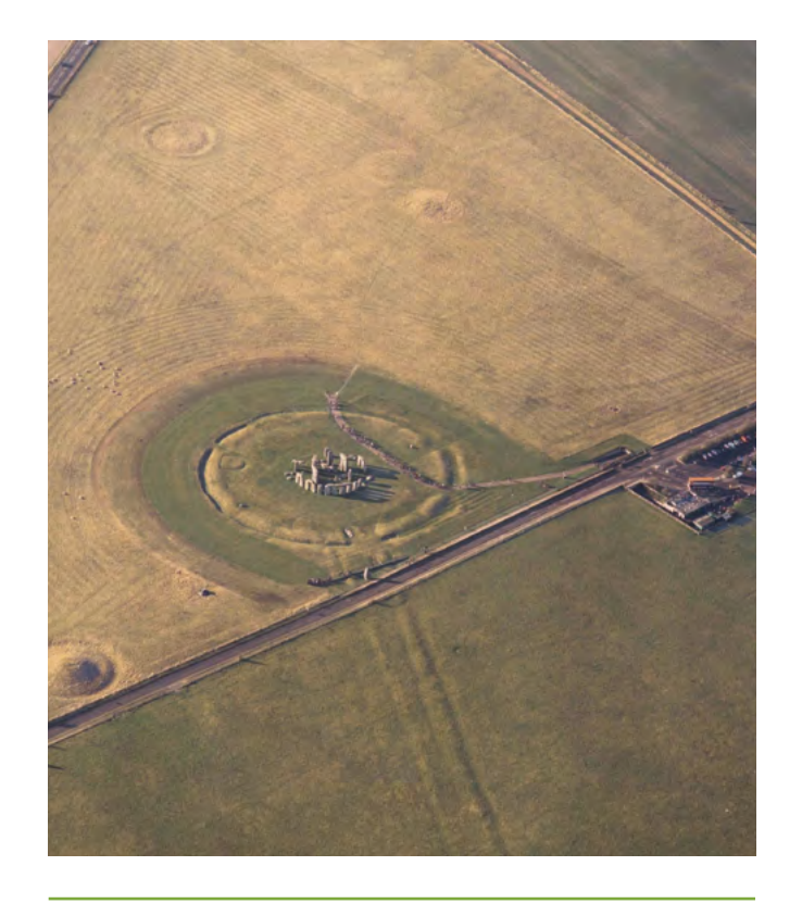
Figure 3 Stonehenge, viewed from the north-east, with the final stretch of the Avenue approaching the monument from the bottom of the photograph.

Several functions have been suggested for the Stonehenge Avenue, none mutually exclusive. One of the best known is that the earthworks of the Avenue demarcated or formalised the route along