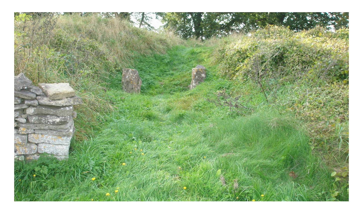
Figure 7 The false entrance at Windmill Tump, Rodmarton, Gloucestershire. Two portal stones are visible amongst the vegetation. The dry stone wall to the left is of modern construction.

These long cairns often encase an earlier, smaller, round mound that covers the passage and chamber. Other structural components are sometimes visible, for example dry stone walling. Many, such as that at Randwick in Gloucestershire, appear to have been constructed using a spinal wall with walled compartments set at right angles to it, but such elements may only be visible where cultivation or excavation has revealed the underlying deposits.