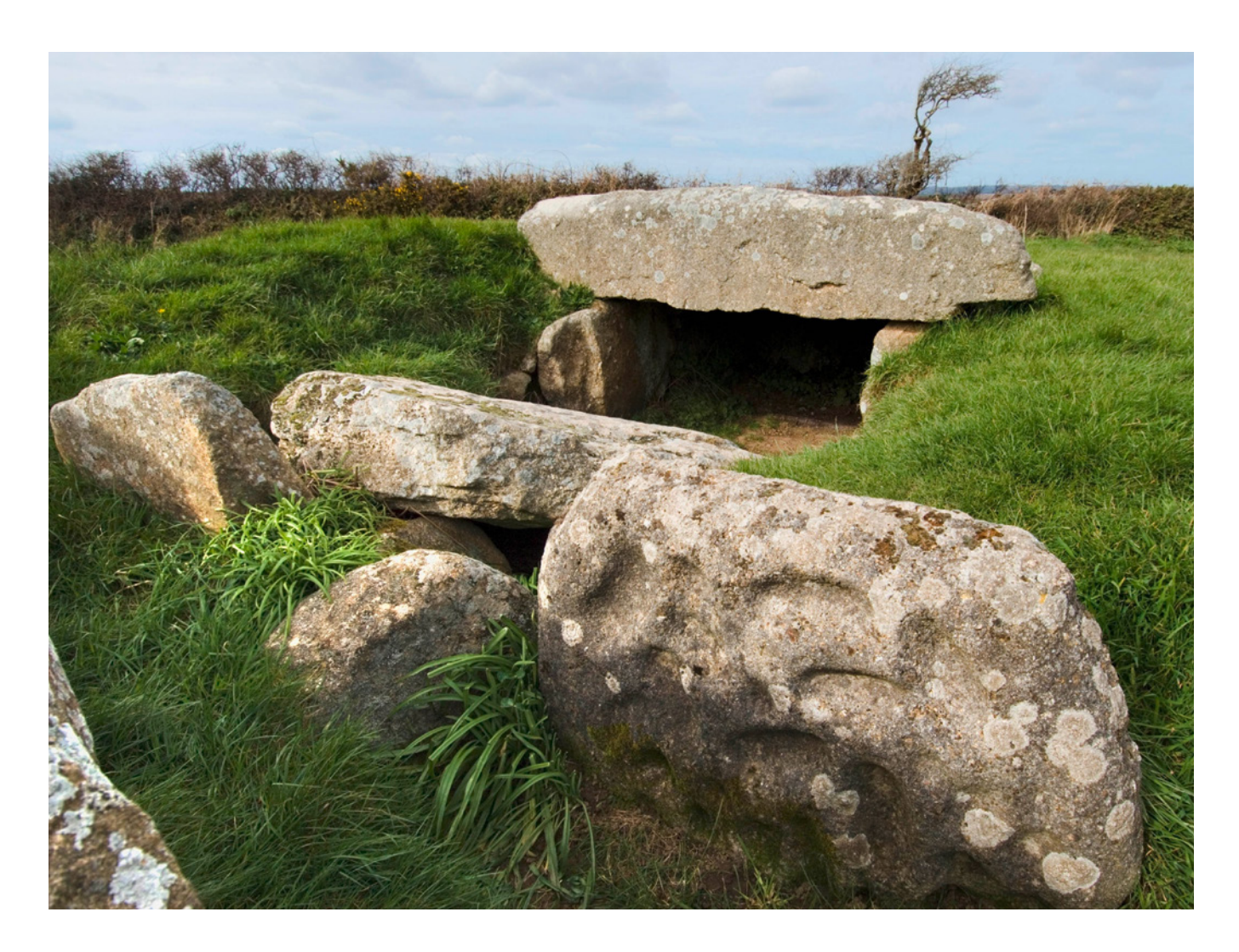
Figure 4 An entrance grave with façade (including a cupmarked stone) set into a cairn at Tregiffian in west Cornwall.

there are six, three on each side. Some, such as Waylands Smithy in Oxfordshire, take on a cruciform shape with a single transept on each side of the passage. Here and in other places, upright stones set at right angles separate the entrance passage and restrict access to the chambers.