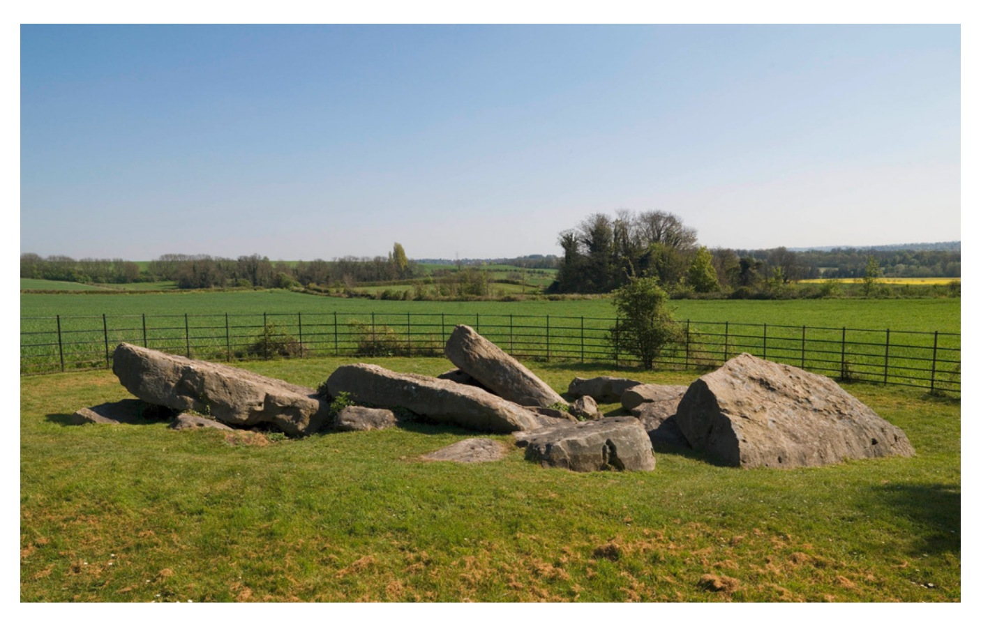
Figure 1 The tumble of large fallen sarsen stones, Little Kit's Coty, near Maidstone in Kent, is thought to have once formed a burial chamber similar to others nearby.

It might be expected from this that megalithic tombs occur mainly in those areas where stone is abundant. For the most part this is so, and Cornwall, Devon, Herefordshire, the Cotswolds and Derbyshire figure prominently on distribution maps of these monuments. However, limestone and sandstone blocks occur further afield,