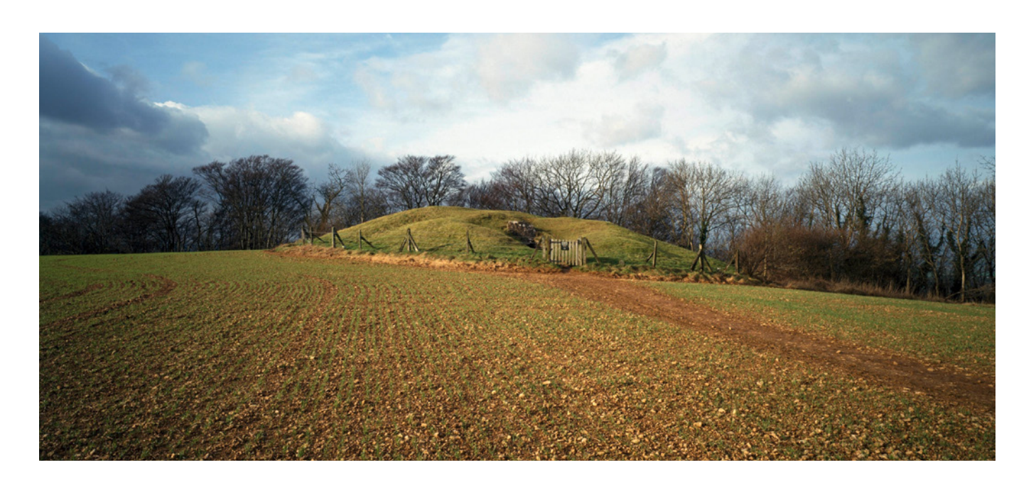
Figure 6 The mound at Hetty Peglers Tump, Uley, Gloucestershire, which covers a passage and several burial chambers, is set on the lip of the escarpment which (were it not for the trees) would have extensive views across the Severn valley.

As noted, mounds of stone, earth or other material were frequently placed over the stone settings, sometimes forming a conical or domeshaped round mound, in others a long rectangular or trapezoidal mound (Figure 6). In their original form these comprised coherent architectural structures, compared to other piles of stone that aggregated as a result of clearance of land for cultivation. However, the distinction between them is often difficult to ascertain, particularly when in the field they are encountered as simple tumbles of stone. Sometimes a greater amount of the superstructure survives but in others it may have been disturbed, denuded or has long been dispersed. Where stone has been taken in historic times for other purposes, some of the larger earthfast stones may be left standing proud. In some cases it is by no means certain that the chamber was covered with a mound and there may be some examples where cairn construction was never completed.