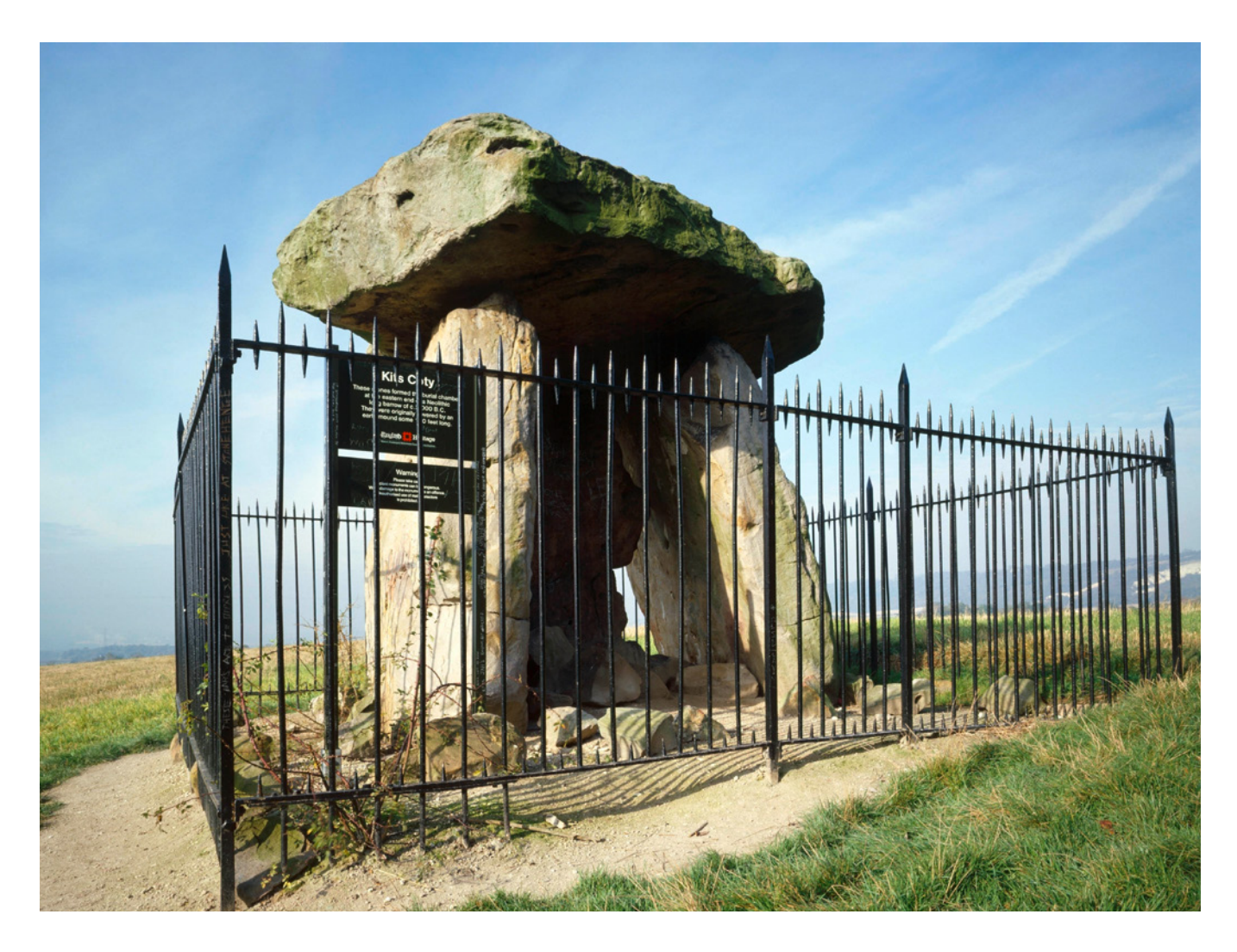
Figure 3 Remains of a burial chamber known as Kit's Coty House, near Maidstone in Kent. This was once encased in a massive long mound of chalk.

Variations in the configuration of the setting of exposed chambers can be found. At Kit's Coty House, in Kent (Figure 3), uprights reach almost 2.5 m and form an H-shaped arrangement surmounted by a large slab.