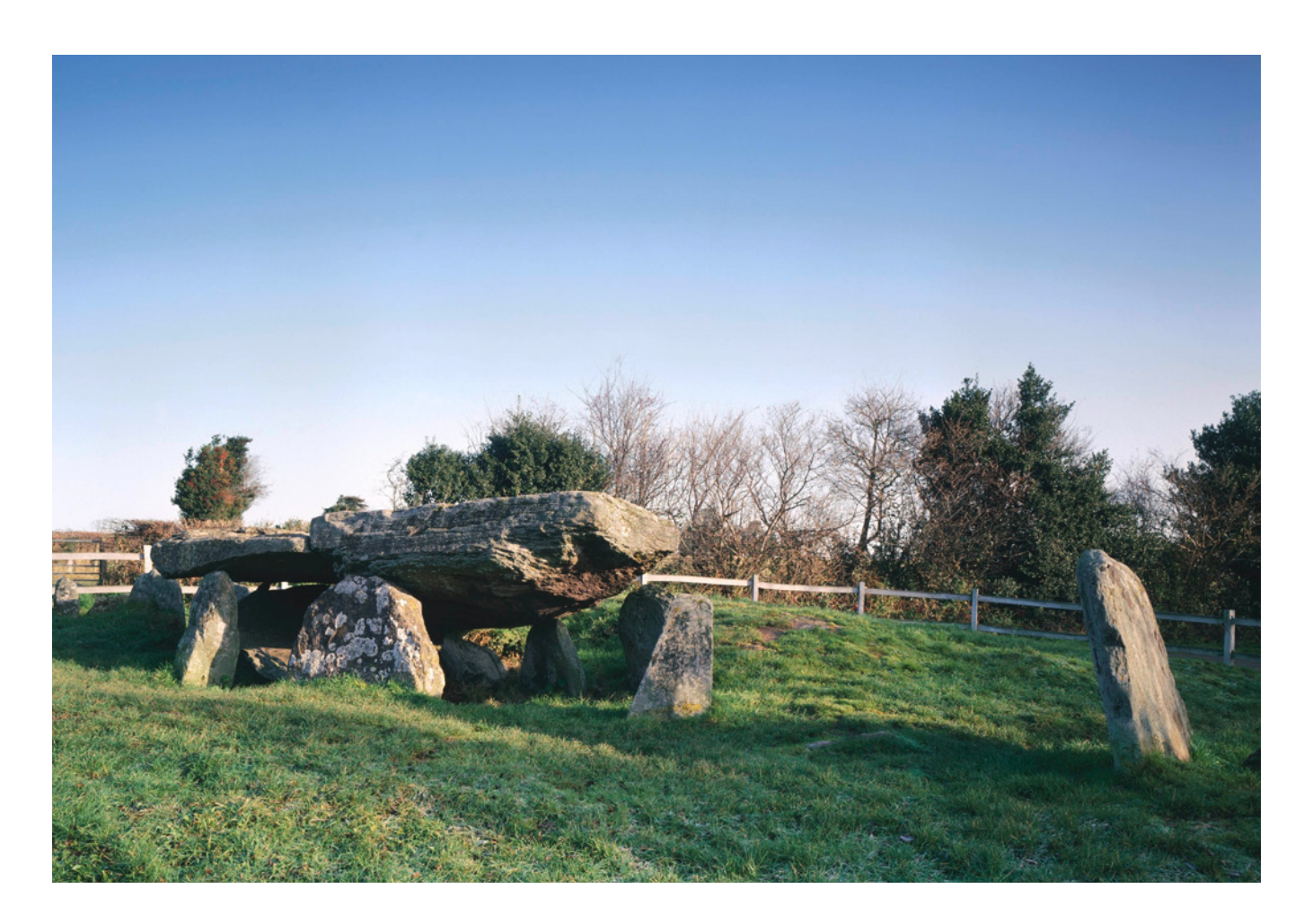
Figure 2 Arthur's Stone, Herefordshire. Note the two portal stones set at right angles to the axis of the chamber. The leaning stone on the right may have formed part of a cedilla or passage.

known are massive monumental versions such as Arthur's Stone, at Dorstone in Herefordshire (Figure 2), which has two large orthostats at one end placed at right angles to the axis of the tomb that form the 'portal', with a third orthostat marking the terminal, all supporting a massive capstone almost 6m long. Closer inspection reveals the presence of further stones that may once have formed a façade or cedilla along with the remnants of a cairn.