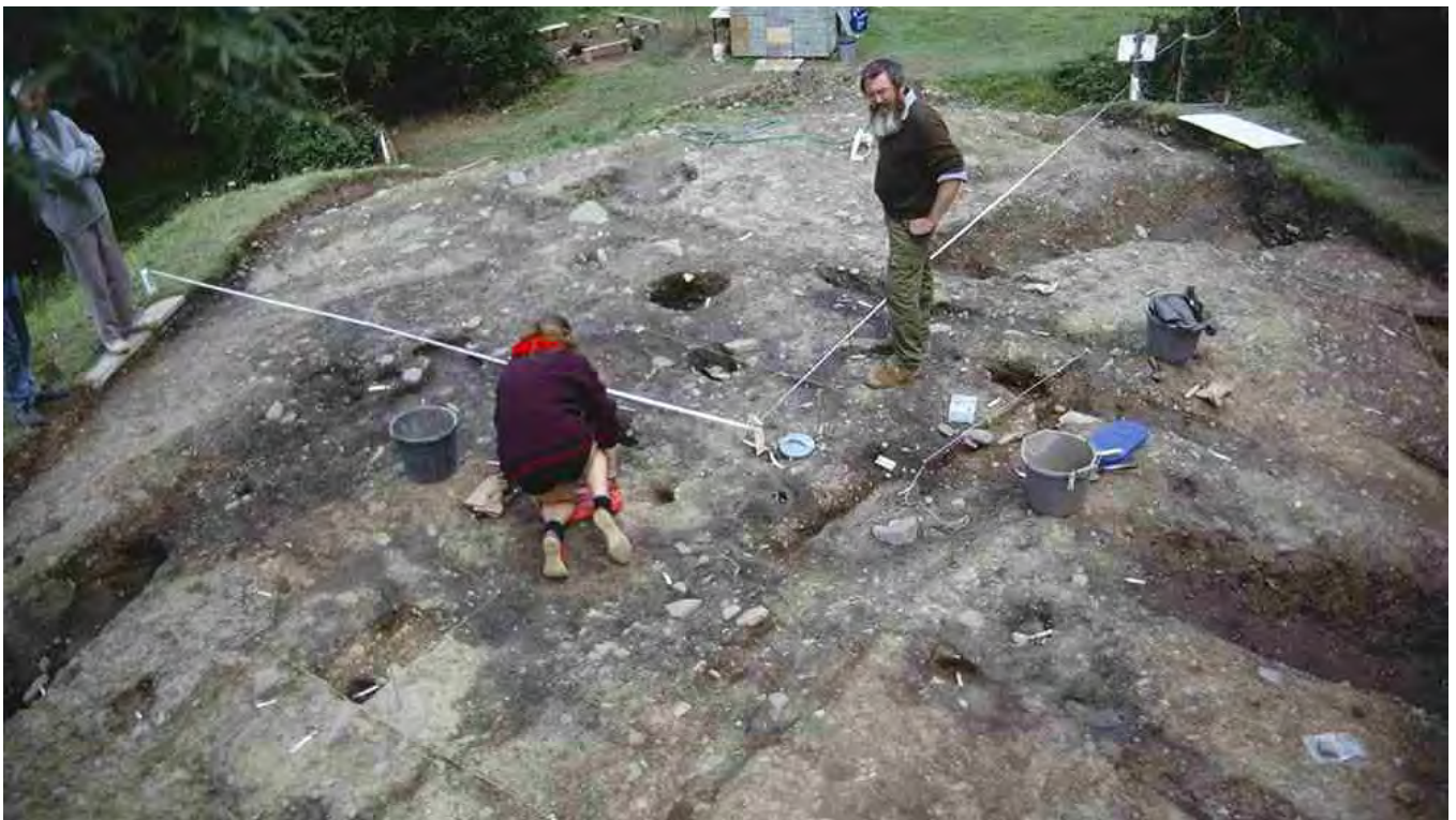
Figure 5 Excavations at Hen Domen, near Montgomery, revealed the archaeological complexity of a simple earthwork. Here the inter-cutting sequence of motte-top halls is investigated in 1991.

The defences of some mottes, and of some ringworks, were enhanced by cutting back the surface of a natural knoll or a promontory so as to strengthen the defences (for instance, Warden, in Northumberland, and Barrow Mump, in Somerset). This ‘scarping’ also tended to render a simple site more dramatic – especially when seen from lower down a slope – and may have been intended to add cachet by making a small stronghold more threatening and dramatic.