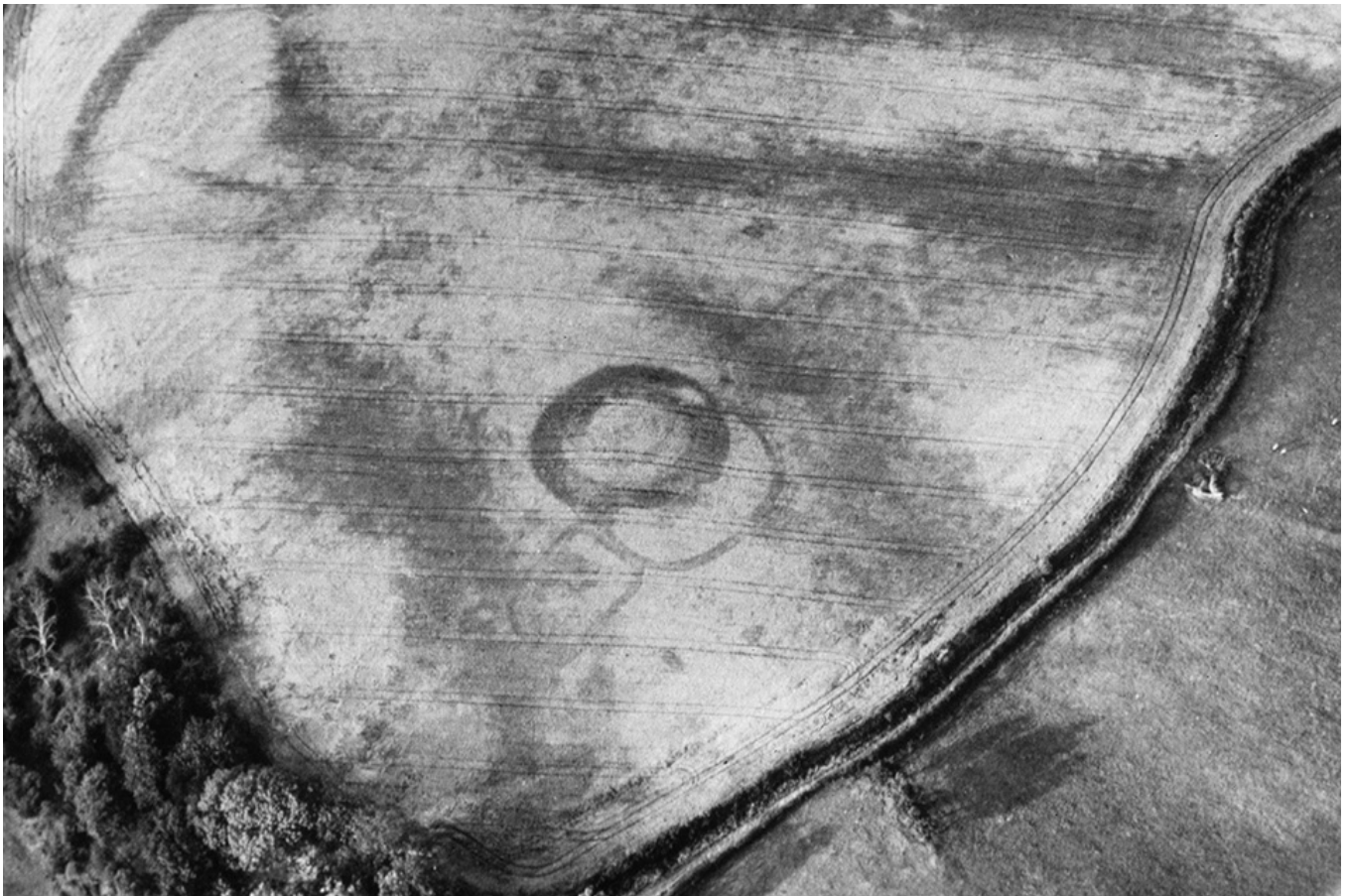
Figure 2 Acton Bank, Lydbury North, Shropshire. A rare example of an entirely levelled castle, here revealed as a crop mark. The dark circle marks the ditch round the motte; thinner lines define bailey enclosures.

There is a great deal that we still do not know about the origin of the castles in England and in France in the 11th century (Figure 3) but social conditions had given rise to powerful families, the existence of which greatly facilitated the establishment of castles, for a castle was a visible manifestation of personal status and authority.