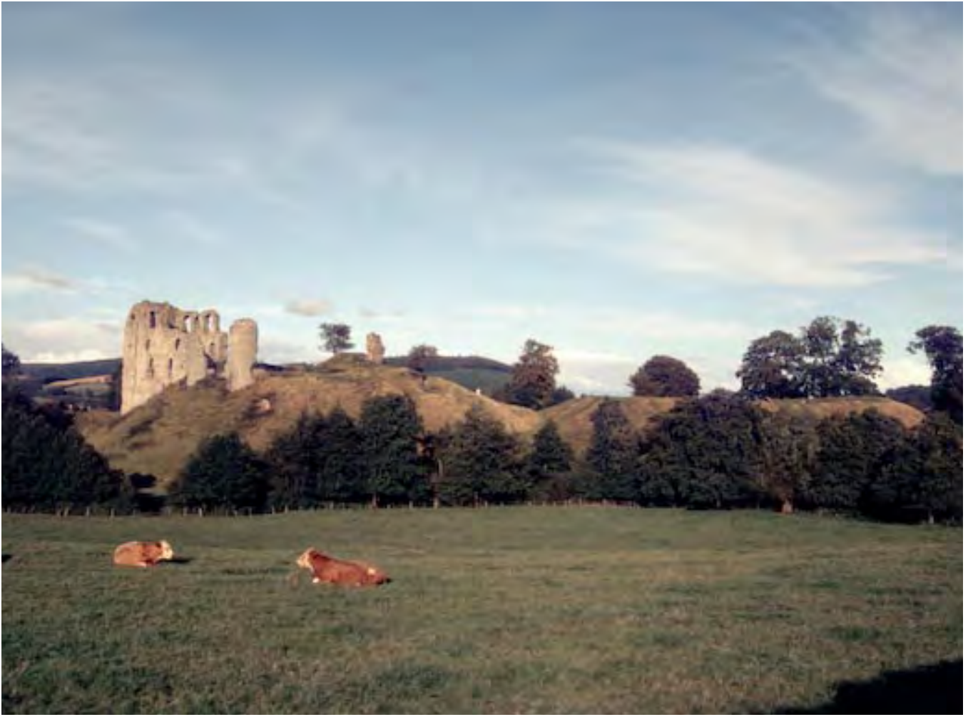
Figure 11 Clun Castle, Shropshire. Clun is an example of a castle which was an important aristocratic power base for several hundred years. Its complex earthworks and masonry remains reflect that.

Great lords continued to live in great castles (Figure 11), but as social and economic patterns changed, the lesser nobility and influential local landowners moved into more convenient accommodation. Some of these new residential complexes were defended by walls or a moat, but this was more against civil disorder and criminality than any armed force.