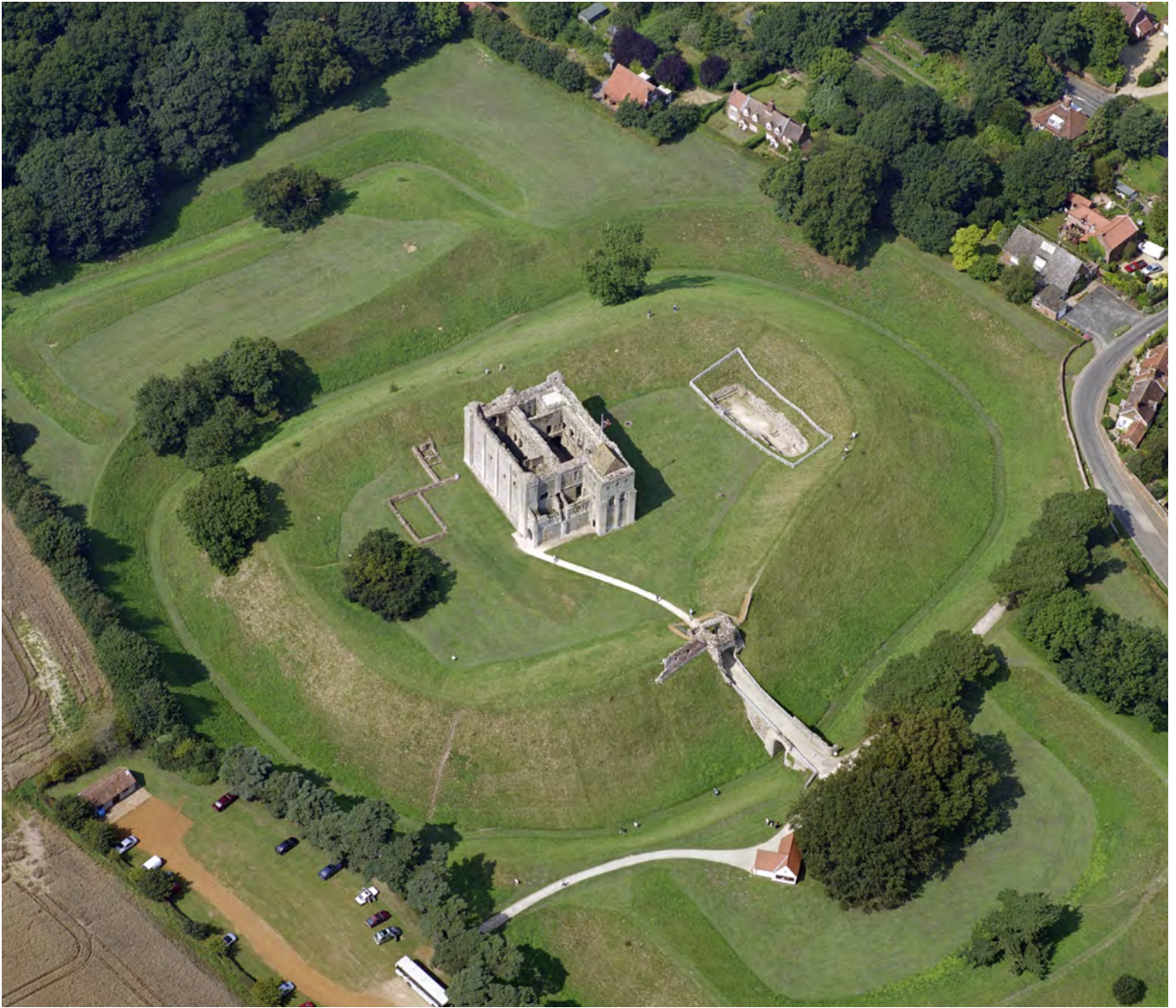
Figure 7 Castle Rising, Norfolk: an earthwork castle that was provided with two baileys.