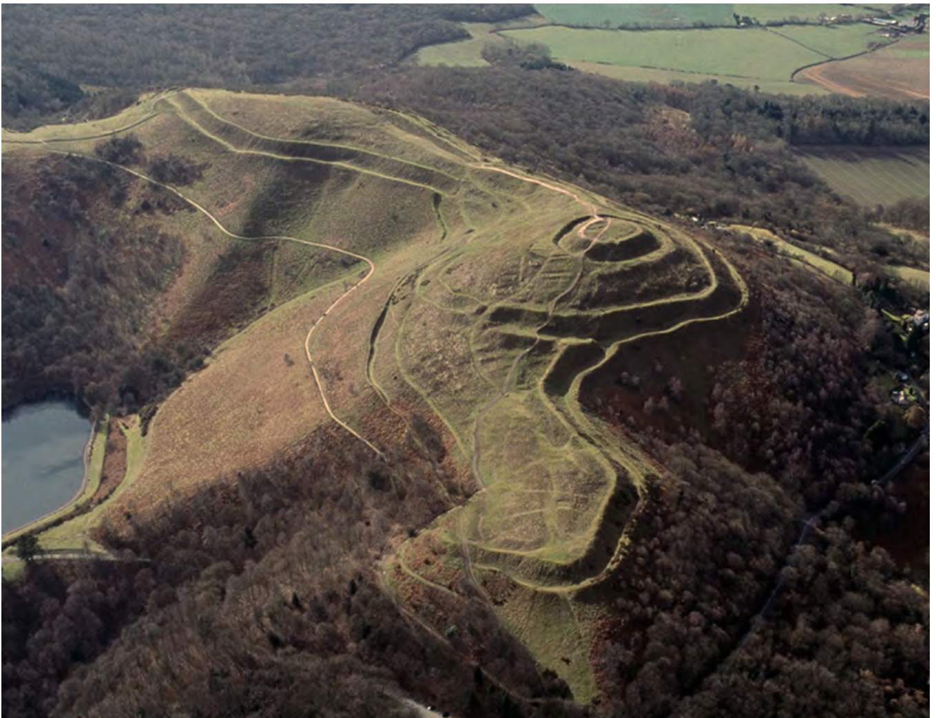
Figure 1 British Camp, on the border of Herefordshire and Worcestershire. This early medieval ringwork castle was set within the defences of an Iron Age hillfort, already over a thousand years old.

Of all historic buildings, the castles of England are some of the most familiar. They were the homes and power-bases of the most influential families, and many of them have been occupied for several hundred years. Less familiar, however, are the predecessors of these grand medieval buildings. The earliest castles in England were not built of stone but had substantial earthwork defences (Figure 1), and their buildings were made of timber. Many of these early castles were rebuilt multiple times and are thus barely traceable beneath their later replacements. Nevertheless, about 700 of these earthwork castles still survive.