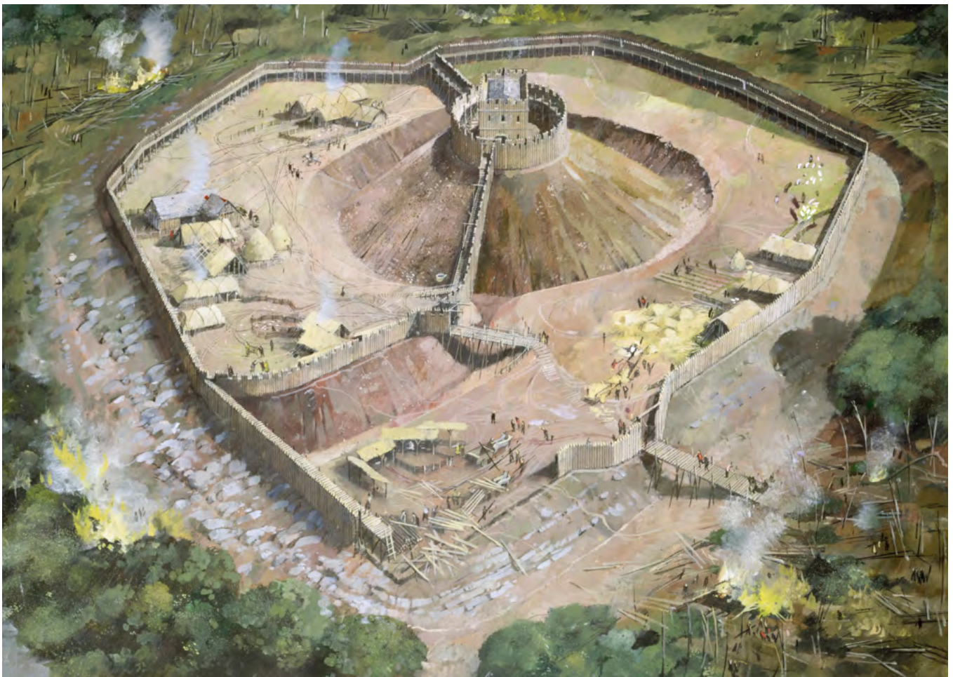
Figure 6 Pickering Castle, North Yorkshire, as it may have appeared in the 12th century.

The bailey enclosed a variety of timber domestic buildings: a hall, a kitchen, stables and stores, and so on. In rare examples a second bailey (Figure 7) was provided; it is possible that these may have had a separate function, serving perhaps as corrals for livestock in times of trouble. A timber palisade probably crowned the bank of the bailey, as on the ringwork.