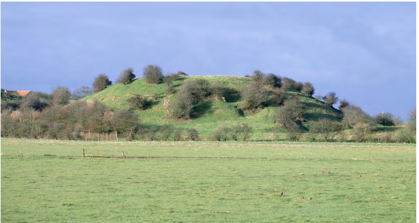
Figure 8 Skipsea Castle, near Hornsea, on the Yorkshire coast. A large earthwork motte reusing an Iron Age mound rises from what is now lush pasture. In the Middle Ages this was a large mere (lake); a causeway gave access to the castle.

In some cases, however, the earlier political and social landscape was ignored entirely in order to establish a new centre of power (Figure 8). A castle constructed within an existing settlement may have been a conscious expression of the domination of the local English population by a new Norman lord. Elsewhere, the same outcome was achieved by the establishment of a new town (Figure 9) outside the castle gate (for instance, Warkworth, Northumberland), or the wealth of a castle might attract a new settlement, less formally established, outside its gate.