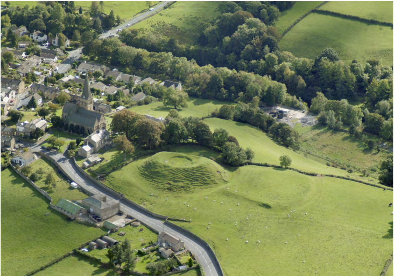
Figure 10 Burton in Lonsdale, North Yorkshire. Castles were administrative centres, as well as military bases. This castle was the centre of the honour (lordship) of Burton, which covered the north-west corner of the West Riding of Yorkshire.

wealth and power of the lord. This, in turn, supported the church which continued to develop long after the small earthwork castle beside it had been abandoned. Many urban centres had a castle which was directly linked to the town defences. Elsewhere, castles were sited to have strategic control of river crossings, ports, main roads, or high ground.