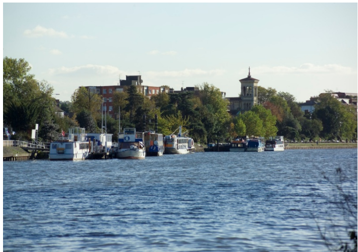
Map and view of the Riverside conservation area.

The residential strip along Portsmouth Road, the Queens Promenade (the river walk with associated riverside uses), and the former Seething Wells with Water Works are three recognizable character areas where the prevailing and historic uses have variously influenced the plan form and the building types of the area.