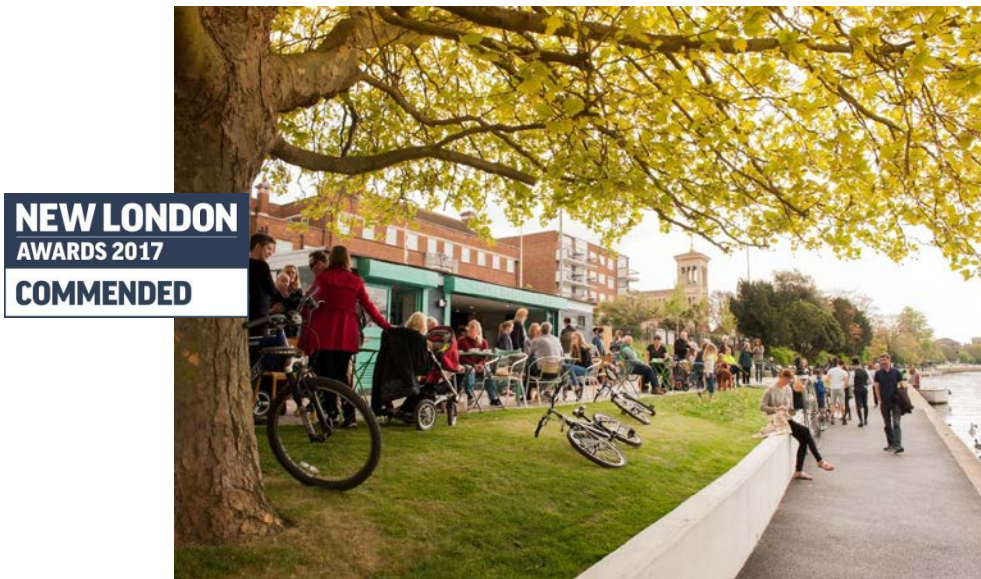
Queens Promenade transformed by the Go Cycle scheme.

The recent Go Cycle scheme provides infrastructure, public realm and landscape improvements along Portsmouth Road. The scheme has transformed parts of the Queens Promenade with landscaping, new planted terraces, seating and natural stone paving, improved road crossings and access to a revitalised riverfront in the spirit of the Victorian Prom. The Promenade provides a local park for adjoining residential areas.