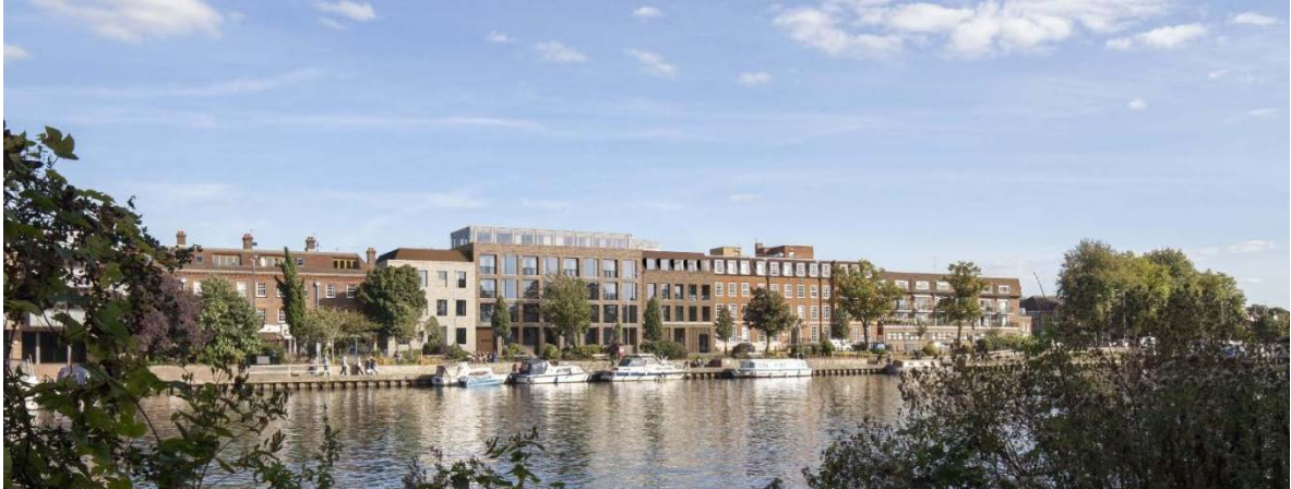
Visualisation of approved development at 45-51 High Street. © Architecture Initiative

The recent Go Cycle scheme provides infrastructure, public realm and landscape improvements along Portsmouth Road. The scheme has transformed parts of the Queens Promenade with landscaping, new planted terraces, seating and natural stone paving, improved road crossings and access to a revitalised riverfront in the spirit of the Victorian Prom. The Promenade provides a local park for adjoining residential areas.