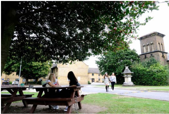
Seething Wells Campus. © Kingston University

From its history as a key regional movement route between London and the Coast, Portsmouth Road has evolved into a busy commuter route from Surrey to Kingston Town Centre dominated by cars and separating the mainly residential development from the Thames. The dominance of cars and highway infrastructure interrupted the views to the river and the setting of the Grade II* listed Church of St Raphael, which can be clearly seen from Hampton Court Palace and Kingston Bridge.