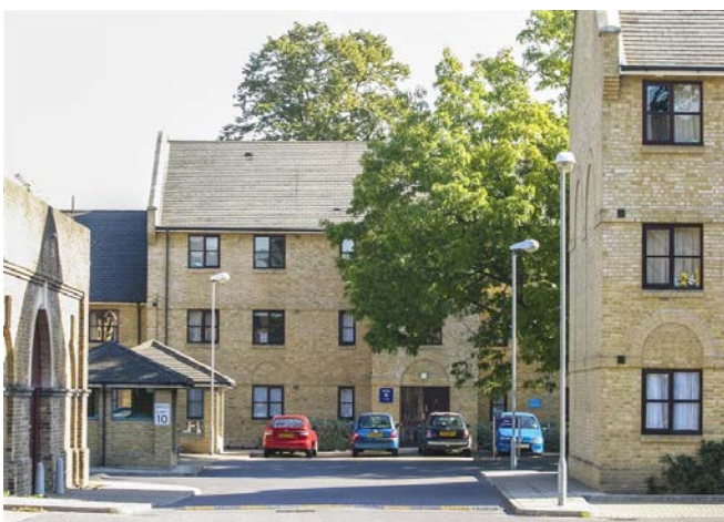
Seething Wells campus- halls of residence.

Further sensitive enhancement to the CA will be delivered by a new mixed use educational and residential development, the GEMs Academy, which will be built at 45-51 High Street. The sensitive new architecture will mediate between the small scale historic architecture of the Old Town Conservation Area and the historic promenade of the Riverside South Conservation Area and will provide necessary teaching and residential facilities thus adding to the vitality of the area.