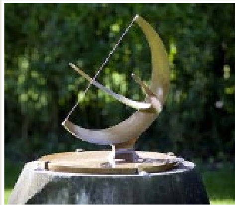
Above: The sundial