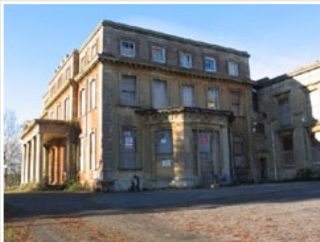
Above: Sandhill Park before the fire