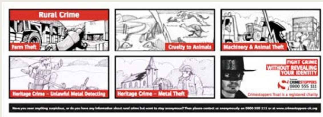
Above: Rural Crime storyboard

The storyboard will be distributed throughout Sussex and the video will be available online in the near future.