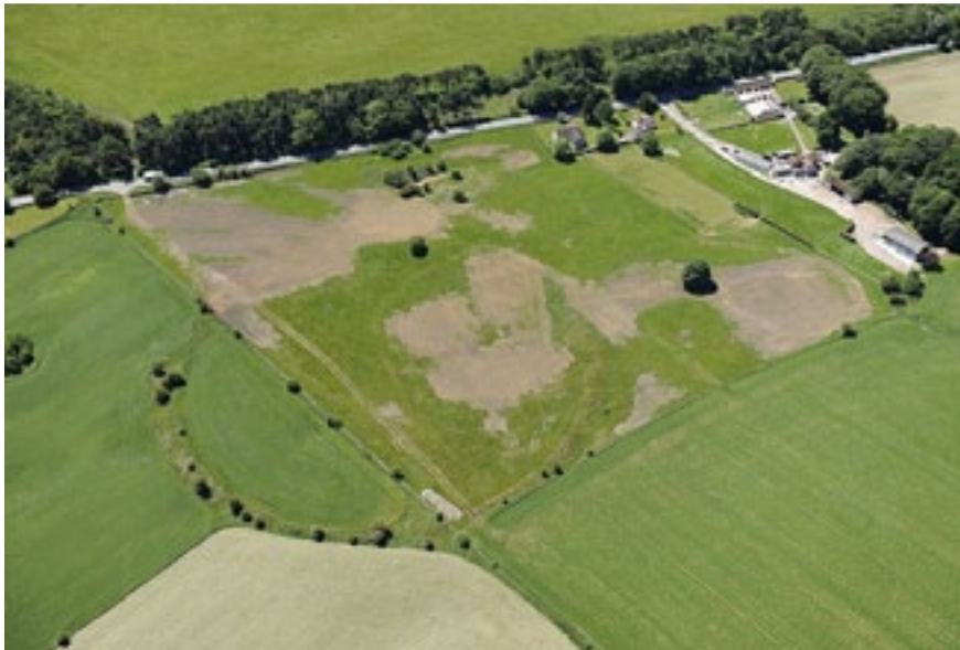
Above: Priddy Circles after the damage