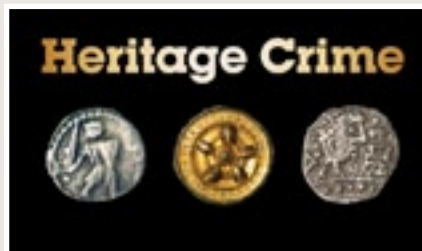
Above: Heritage Crime exhibition logo

The exhibition, created in partnership with Lincolnshire Police explored some of the issues caused by crimes against heritage, and the steps being taken in Lincolnshire to stop them. The exhibition featured material confiscated in a recent high profile court case in which a 'nighthawker' (illegal metal detector user) was prosecuted, and examples of fake antiquities on sale to the public and mistakenly collected by the museum in the past.