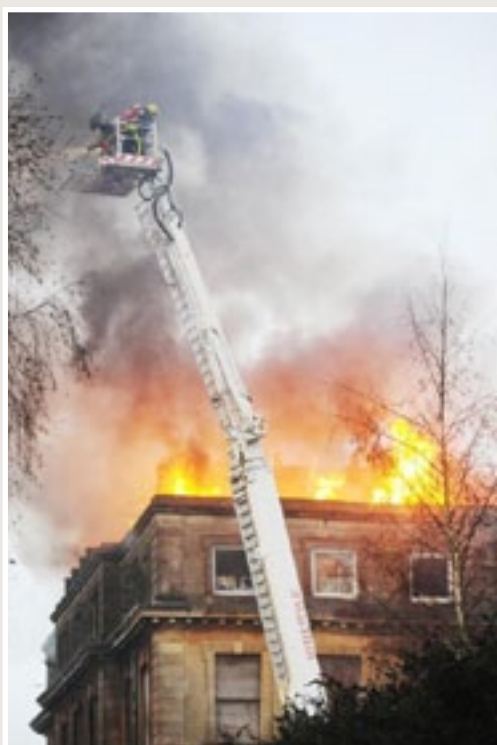
Above: Sandhill Park after the fire